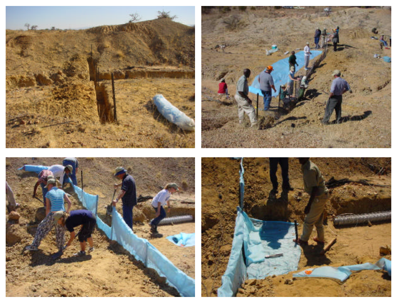
Figure 6 shows the steps in the construction of a silt-screen. Girls from two schools in Pretoria on the Mabula Game farm carried out this exercise. In photo 1 the trench is dug across the erosion channel and Y standards are placed to form the main part of the structure. In photo 2 the Y standards are connected with stay wires and covered with wire mesh. The structure is then covered with a biodegradable geo-textile in photo 3. In photo 4 the structure is completed by adding an apron, made of geo-textile and wire mesh.

The silt-screen is used to trap small particles and seeds, whilst permitting the water to pass through. In this way the fertile trapped soil will permit the re-growth of vegetation and aid the stabilization of the soil. These structures are placed at intervals such that the re-growth of the one structure will reach the overflow of the previous one.