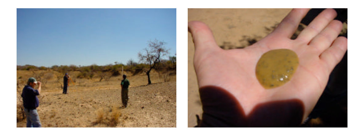
Figure 7. The photo on the left shows an area without topsoil or plant material. The position of the contour is being determined. The photo on the right shows the silicate mineral after water has been added.

The silicate water retardant will absorb water during rains, but will then retain it for use by the plants during dry spells. Because the geo-textile material is biodegradable, it will decompose with time after the plants have established themselves.