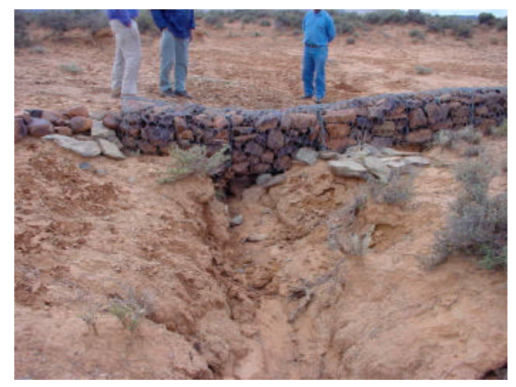
Figure 5. An example of an inappropriately designed gabion. No geotextile or apron was used in this case and erosion eventually occurred under the structure. No provision was made to prevent erosion at the overflow.