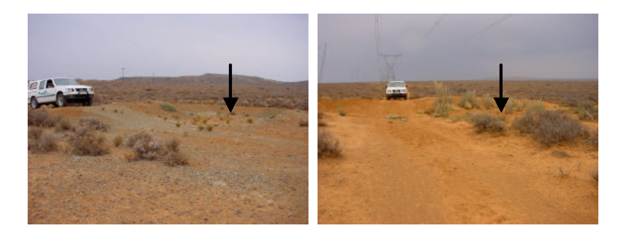
Figure 4. Examples of well constructed berms under the Hydra-Droërivier 1&3 lines. This design uses an overflow dam to spread water collected by the berm (see arrows). After ten years virtually no maintenance is required on these structures.

soils may cause a change in route. Normally access roads run along the line and mitigation for runoff consists of the building of berms.