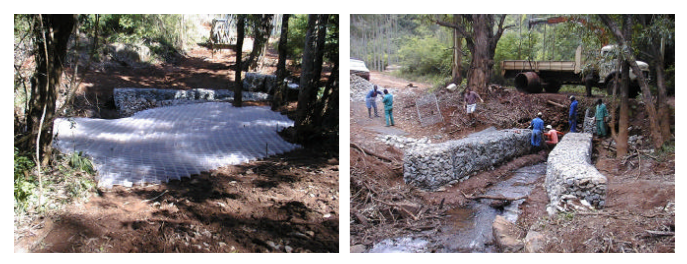
Figure 3. Extensive measures taken to prevent erosion, during the construction of access roads for a new power line. Continuous cellular mat (left) and gabions (right) are some of the measures used during the building of access roads during the construction phase of a power line..

During the construction phase of a power line, the impacts of vegetation clearing and the formation of roads for large vehicles has probably the most profound effect on erosion, if the necessary care is not taken.