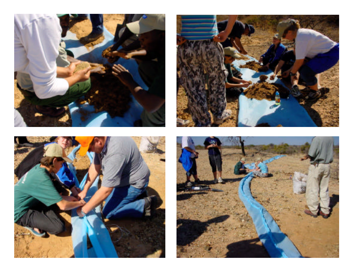
Figure 8 . The photo's show the mixing of the soil, the manure seed and silicate mineral before placing it in the geotextile bags.