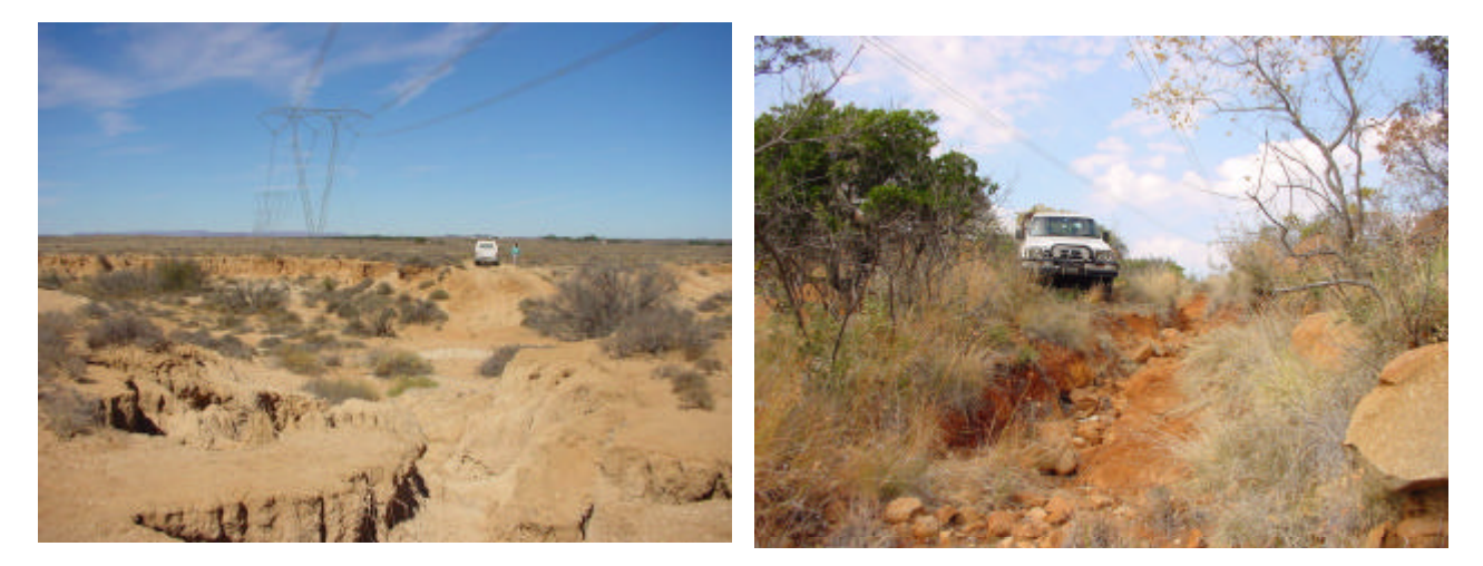
Figure 2. Examples of erosion in the servitude, which hampers access during maintenance and emergencies.

• Secondly, erosion in the area between towers may not threaten the towers directly or initially, but will prevent access for maintenance or emergency repair purposes.